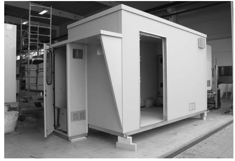
Figure 4 : This Analyser Containment Building Is Designed To Withstand Blast Loads As High As 300 Mbar This Image Will Be Provided Shortly.

enced by the same issues, such as weight, thermal insulation, corrosion resistance, etc. However, it is also likely to have to take into account factors such as fire resistance and possibly the need for antistatic precautions to prevent sparks being caused by electrostatic charging – the demand for explosion-proof equipment that meets the IEC 60079 standard for use in potentially explosive atmospheres is mandatory in many applications.