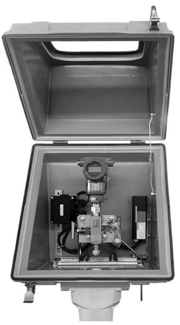
Figure 1: Intertec's Diabox Protective Enclosures Provide Easy Access For Maintenance.

Engineers tasked with choosing and configuring enclosures, cabinets and shelters for offshore applications face a multitude of conflicting demands. Not only must the unit provide protection against extreme cold or extreme heat – depending on platform location – but it must also be resistant to a host of environmental and other factors, such as salt spray, sour gas, high wind velocities, UV exposure and possibly high pressure blasts. Topping out this wish list, the enclosure needs to have a robust structural integrity, a very long service life and yet weigh as little as possible – as all topside weight on offshore platforms is an expensive commodity. Many of these demands are common to all types of protective enclosure, regardless of whether they are small instrumentation housings or relatively large shelters. This article looks at some of the issues behind each category.