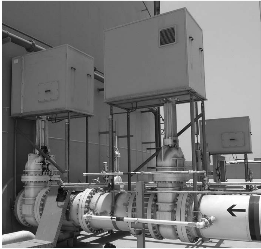
Figure 3 : Grp-based Fire Protection Enclosure For A Valve Actuation System.

type of collaborative approach to enclosure design, configuration and supply is becoming more common, as companies strive to reduce costs in their procurement processes.